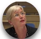
Bente Mikkelsen , Director, NCD Department, UCN, WHO

“Although NCDs wind up in the health system, their determinants are driven by sectors well beyond the health sector. Achieving policy coherence is an incredibly hard task and leadership at the highest political level is undoubtedly required to push for action and accountability across all sectors of government.”