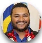
Gaafar Uberbelau , Hon Minister of Health and Human Services, Palau

“Our national task force on NCDs comprises numerous government ministries, civil society organizations as well as traditional leaders who have a seat at the table. As we look further upstream with NCDs and their risk factors, we also need to look upstream in our health system and continuously realign and reorganize ourselves to ensure we remain effective in our efforts to remain one step ahead of the NCD crisis.”