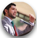
Fabio Medrano , Mayor of Paipa, Colombia

“We are securing continuity in our actions through the formalization of a municipal agreement whereby health will continue to be integrated in all municipal strategic planning and the fight on NCDs can be done with a long-term view.”