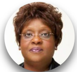
H.E. Dr Isaura Nyusi , First Lady of Mozambique

“We should aim at implementing multisectoral actions that we are already know are effective in reducing the burden of NCDs. This includes ensuring adequate technical resources across all governmental sectors and the sustained involvement of civil society organizations and the community.”